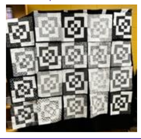
January Optical Illusion