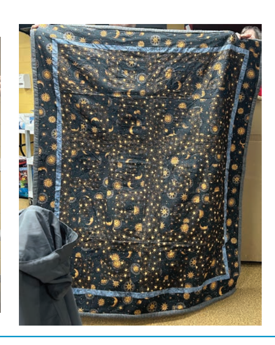
Pat O. Mystery Quilt from Bee Meetings Surfboard Quilt