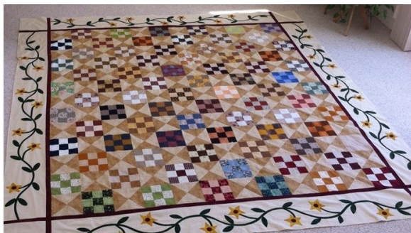
Next year's raffle quilt—top almost completed