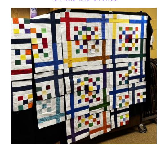
October Sticks and Stones