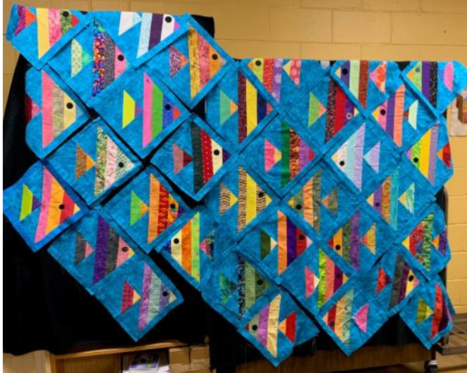
October Rainbow Fish