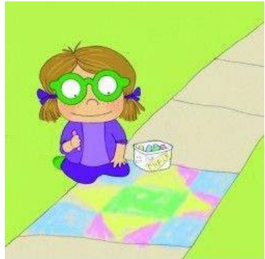
Many parents fail to recognize the early warning signs of Obsessive Quilting Disorder.